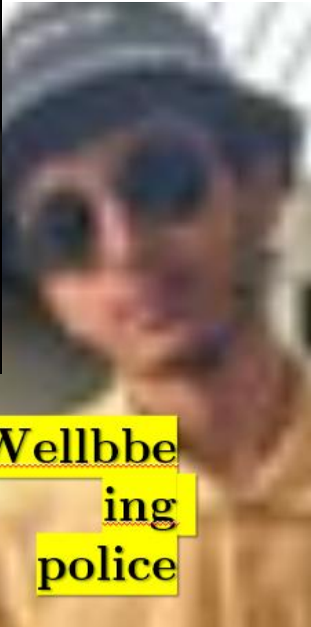
Wellbber ing police