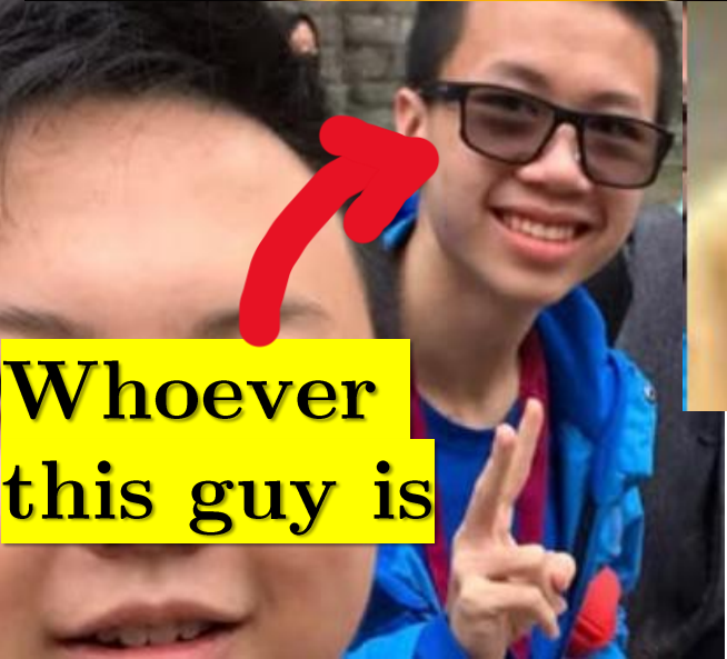
Whoever this guy is