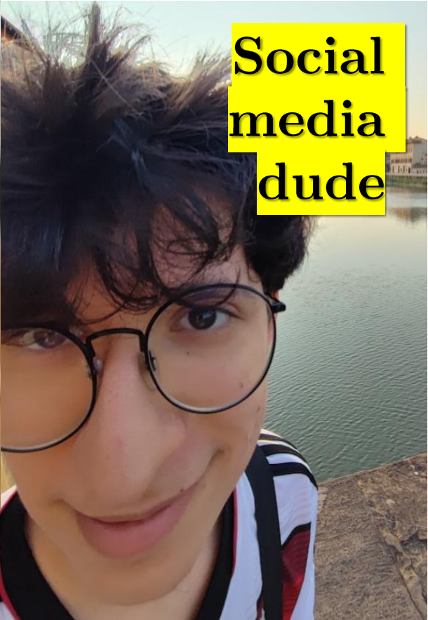
Social media dude